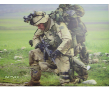
Women Reaching Women in Brevard "The Effects of War"

Thus, just 10 months ago in a night dream I was given the vision for Women Reaching Women and since then there has been the building of amazing relationships and community awareness to provide funding for the counseling of women and children who have no