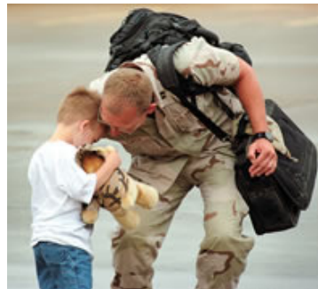
It is not only those deployed that pay the cost for our freedom — it is the families as well.